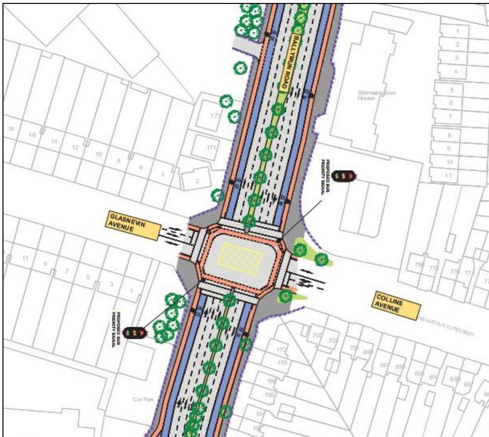
Figure 2 – Map 4 - Page 35- BusConnects Preferred Route Document

For the BusConnects corridors project, the BusConnects corridor schemes do not run on Glasnevin Ave., and there are no impacts on trees on the junction with Glasnevin Ave. on the Ballymun Scheme