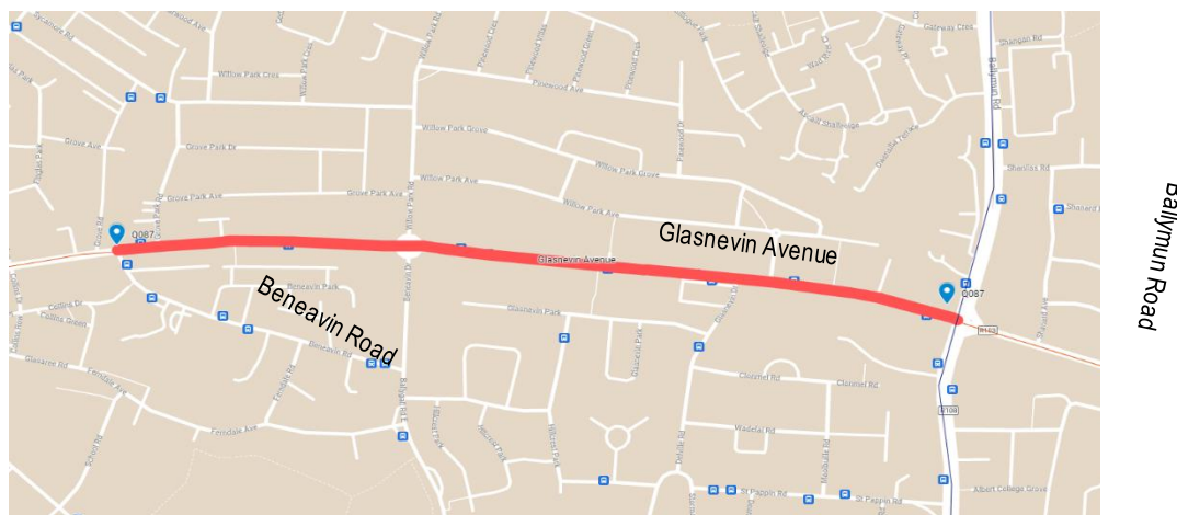
Figure 1 – DCC210001 – Glasnevin Ave - Google Map (mymaps)

There has been no decision made to remove the trees along Glasnevin Avenue. However, there is a proposal to for cycling and walking infrastructure along the entire length of Glasnevin Avenue, from Beneavin Road to Ballymun Road. This will be implemented as part of the Finglas to Killester Corridor, in line with the National Transport Authority's funding proposals for the next five years. This stretch is shown in the image below.